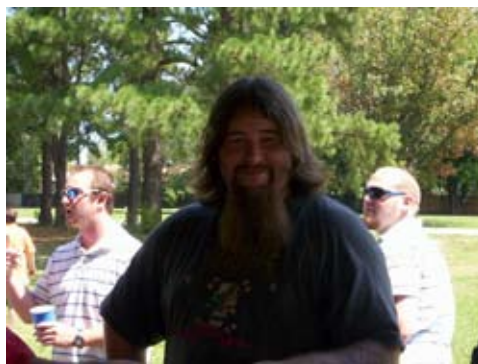
"How you doin'?"