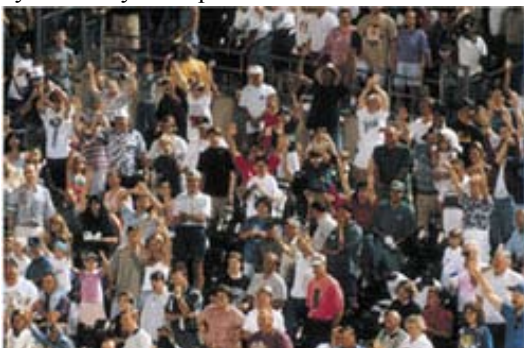
Apprentices and their families

It's Saturday, July 28 th , 7:15 p.m. and here's the opening pitch. The crowd continues to pour into Harbor Park to see the Norfolk Tides face the Ottawa Lynx. The stadium is filled with fans, and the special guests tonight are the students of the Northrop Grumman Apprentice School, their families, and their friends. It's Tides Night for the Apprentice School.