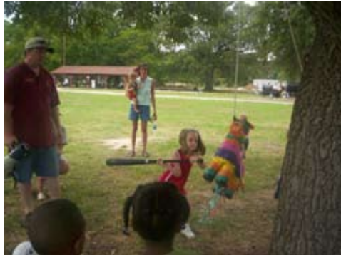
"What'd you say about my mama!?!"

Tickets handed out to everyone when they arrived raffled off the door prizes. The ticket numbers were randomly drawn from a bucket at three different intervals throughout the day. The prizes consisted of $25 gift cards from Best Buy, Golden Corral, and Circuit City just to name a few. Everyone, family, friends, and even man's best friend had a great time. For those of you that missed it, we hope to see you next year.