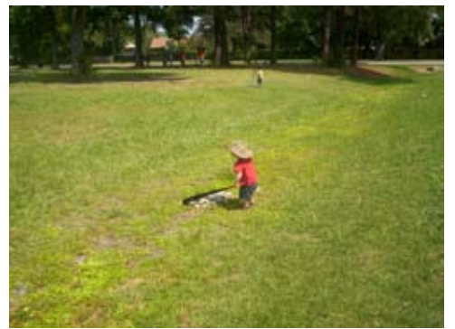
"I'm gonna get that wascowy wabbit!"