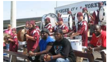
Builder fans enjoying the drumline debut.

Keep your eyes and ears open for the Drumline at our future athletic events. The Drumline will be performing at selected home games during the Builder Football and Basketball seasons. They also plan to perform at selected local parades and civic events in the next few months.