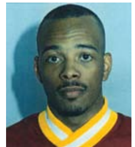
Apprentice School 1997

"Every day you should give your best possible effort; the rest will come with time."